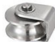
EG- 钢轮 D