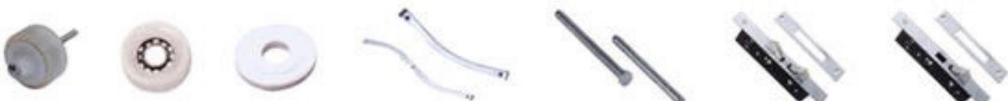
BG-1884 BG-1885 BG-1886 BG-1887 BG-1888 BG-1889 BG-1890