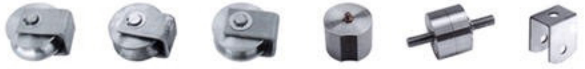
BG-1847 BG-1854 BG-1855 BG-1856 BG-1857 BG-1858 BG-1859