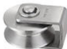
EG- 钢轮 B