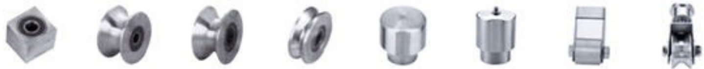
BG-1868 BG-1869 BG-1870 BG-1871 BG-1872 BG-1873 BG-1874 BG-1875