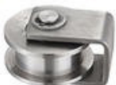
EG- 钢轮 A