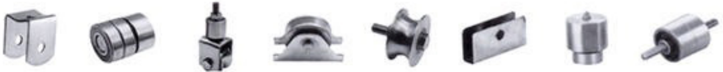
BG-1860 BG-1861 BG-1862 BG-1863 BG-1864 BG-1865 BG-1866 BG-1867