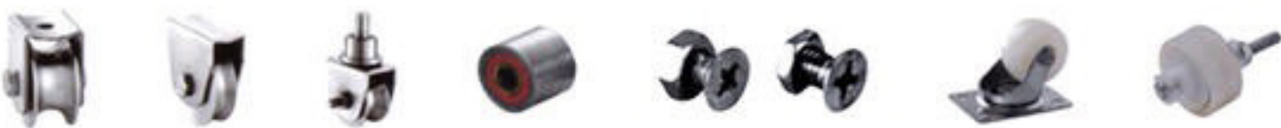
BG-1876 BG-1877 BG-1878 BG-1879 BG-1880 BG-1881 BG-1882 BG-1883