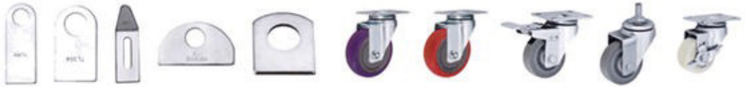
BG-1837 BG-1838 BG-1839 BG-1840 BG-1841 BG-1842 BG-1843 BG-1844 BG-1845 BG-1846