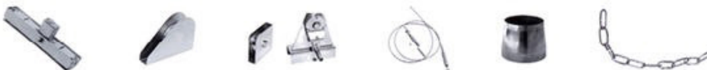
BG-1891 BG-1892 BG-1893 BG-1894 BG-1895 BG-1896