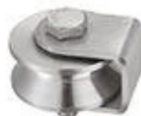
EG- 钢轮 C