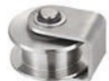
EG- 钢轮 E